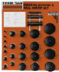
No. 27793 Starter Set