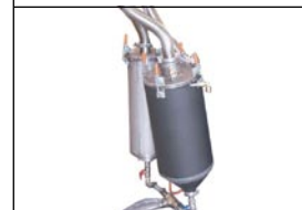
Cyclones V8, rehm